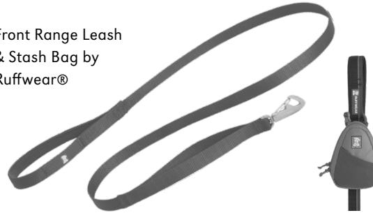
Front Range Leash & Stash Bag by Ruffwear®

you should be able to fit two fingers under the collar. Most hiking areas require a leash that is 6-ft. or less in length. Look for a leash with a secure collar attachment and a comfortable hand grip.