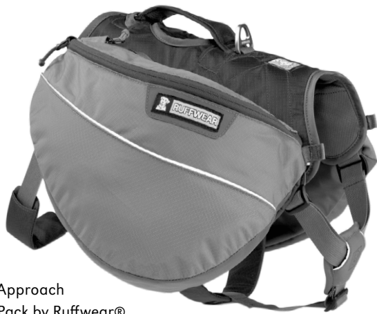
Approach Pack by Ruffwear®

A dog pack allows your dog to become a part of your next adventure. Dog packs come in various sizes, ranging from a simple hydration pack to a multi-day backpacking trip size. A dog in top trail shape should be able to carry up to one third of its body weight in a properly-fit dog pack. Allow your dog to become conditioned to carrying a pack before setting off on a longer hike. Fitting a dog pack starts off with measuring a dog's girth at the widest part of the rib cage. A correctly-sized pack has multiple adjustment points to fine tune the perfect fit.