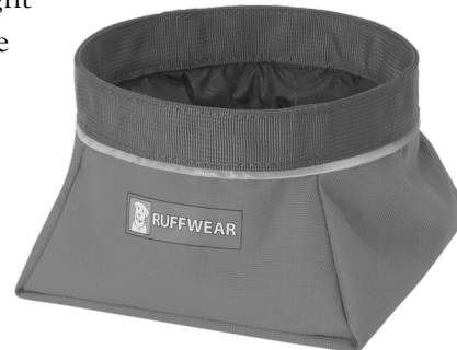
Quencher by Ruffwear®

Hydration on the trail is just as important for your dog as it is for you. For overall hydration, dogs require about one ounce of water per pound on a daily basis. When they are exerting themselves, they may require more. The weather may also be a factor to consider, as well, with warmer weather outings requiring more water. A collapsible bowl for water and food is a great choice for your hike. They are lightweight and are space saving.